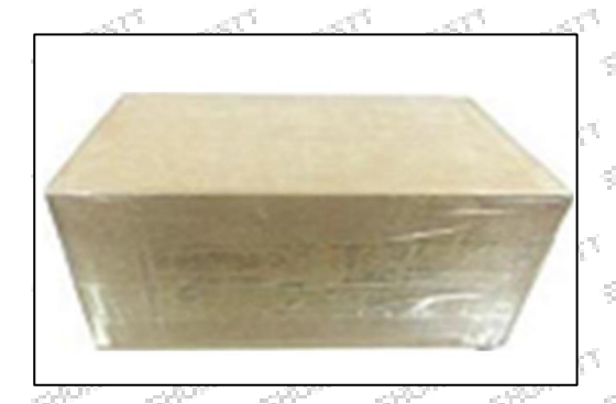
Pic No. 2 Domestic express packaging:

Minors are prohibited from using transparent tape, yellow tape, black wrapping protective film, and white wrapping protective film to avoid personal injury.